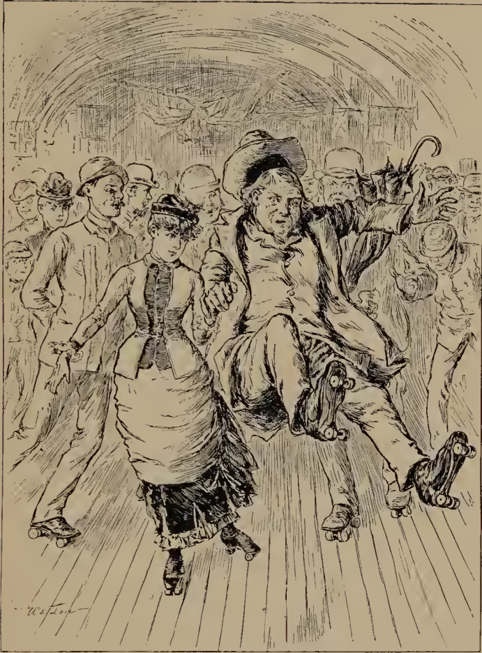
“WHEN ALL TO ONCE THE WHEELS”